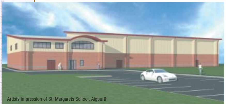
Artists impression of St. Margarets School, Aigburth